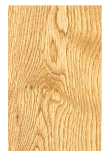
White Oak Multi-Layer

Finish: UV Oiled, Brushed & UV Oiled or Unfinished.