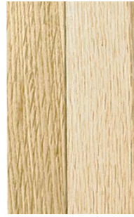
White Oak Select