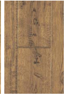
Extra Antique Oak