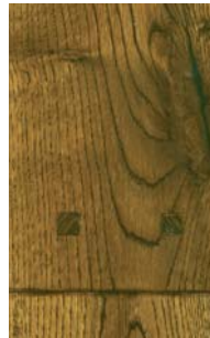
Antique Naval Oak