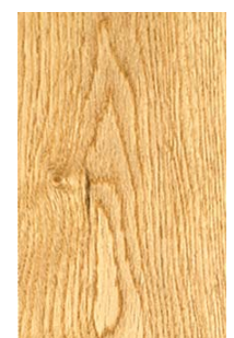
White Oak Multi-Layer